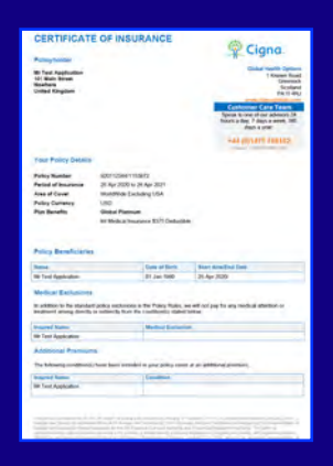
Insurance A record of your plan, premium, level of cover and