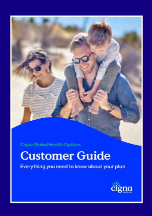
Customer Guide Learn how your plan works and see all the benefits you have access to.