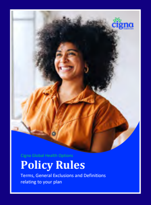
Policy Rules The terms and conditions, general exclusions and definitions of your policy.